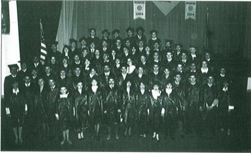
Graduating Class, 1994.

HIS HOLINESS THE LATE VAZKEN I Catholikos of All Armenians