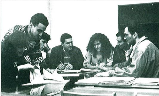
Students working on a team project.

In accordance with the policy of establishing research centers in conjunction with academic programs a Center for Public Health Service is under organization. This Center will address topics in demography, biostatistics, epidemiology, environmental health, and health service management.