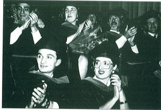
Graduates during 1993 Commencement.

PETE WILSON Governor, State of California