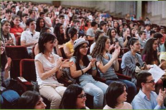
Students at the AUA Matriculation Ceremony