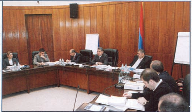
PM Tigran Sargsyan Presiding Over the NCFA Board Meeting

The numbers and facts are staggering. In 2013, about 1,000,000 tourists visited Armenia! It is estimated that each additional 100,000 tourists to Armenia can create 1,000 jobs. Official sources also estimate that each tourist to Armenia spends approximately $1,300 per week!