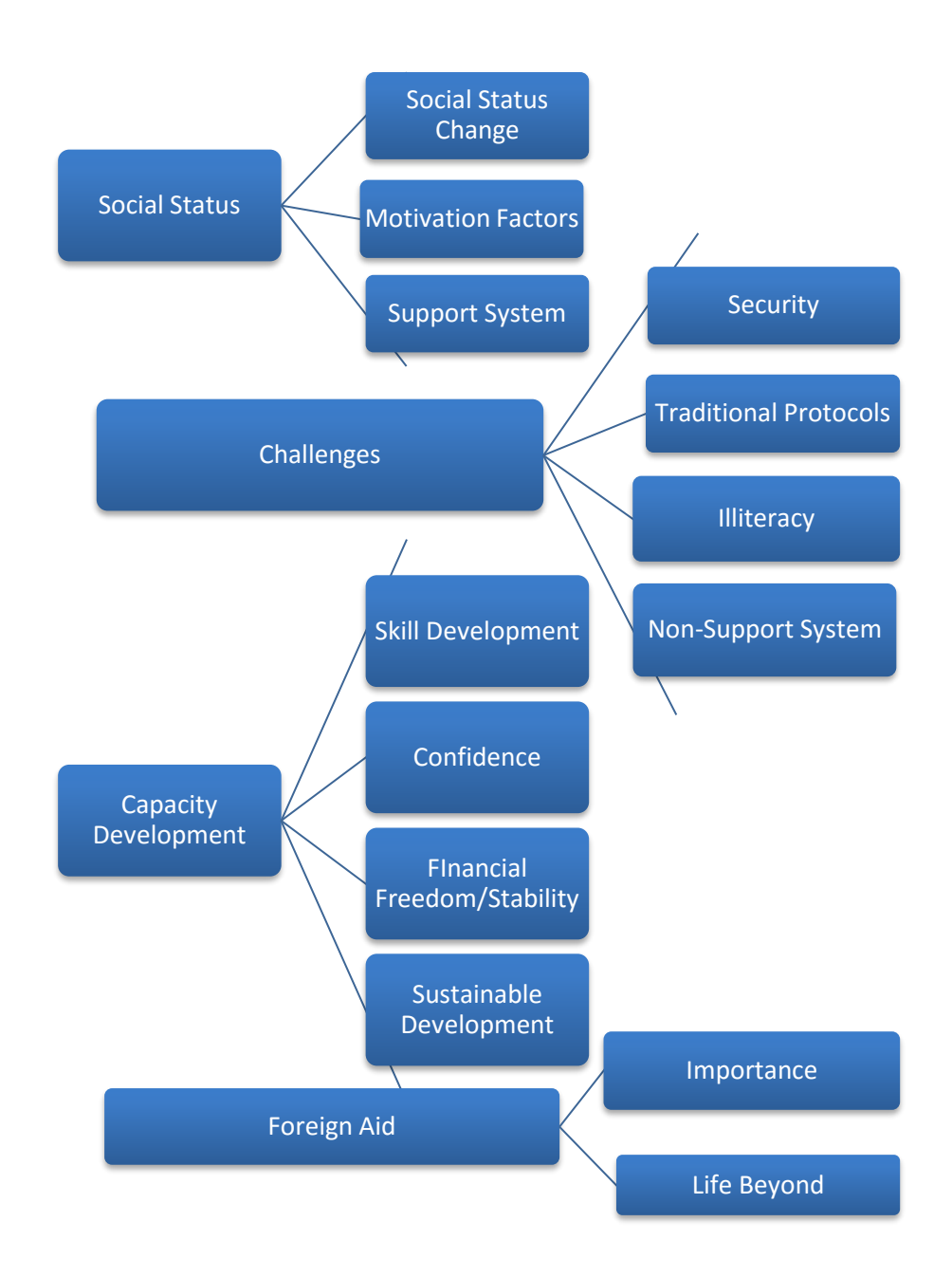
Figure R1. Main themes and subthemes.