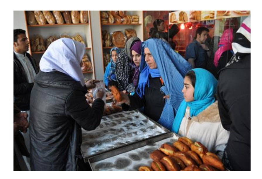
Figure S3 . The new bakery has become a popular place to buy bread, cakes, and sweets.