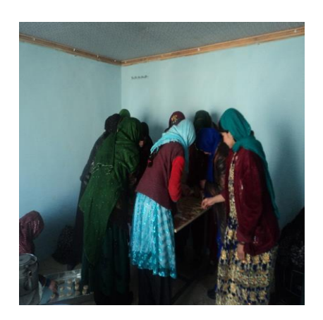
Figure S2. Women learn to operate the new baking equipment.