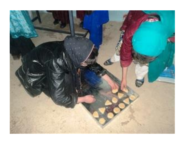
Figure S1 . Women prepare a tray of cookies for baking.