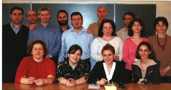
Giving back to AUA takes on new meaning for several AUA alumni who are pursuing challenging professional careers within their home institution. Here are some of those alumni.