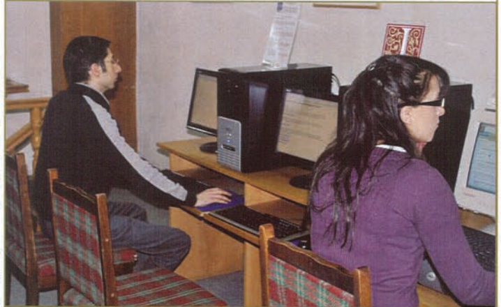
Thanks to the donation of AGBU YPGNY and YPLA the students at AUA can access the ACM Digital Library

To date, AGBU YP contributions to this cause total over $10,000. In appreciation of the generosity the AGBU YPs were recognized by AUA with an inscription of the organization's name on the marble AUA Honor Wall, joining the longstanding list of donors.