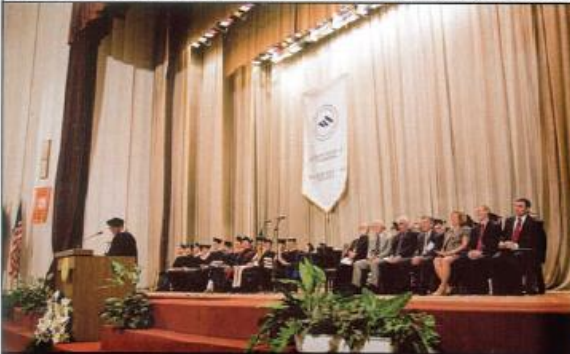
AUA President, Trustees, Deans, Professors and invited guests