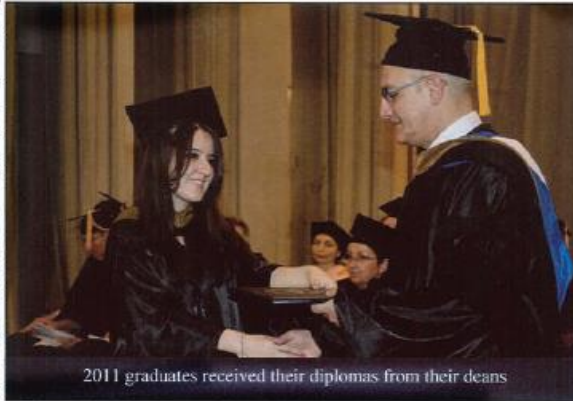
2011 graduates received their diplomas from their deans