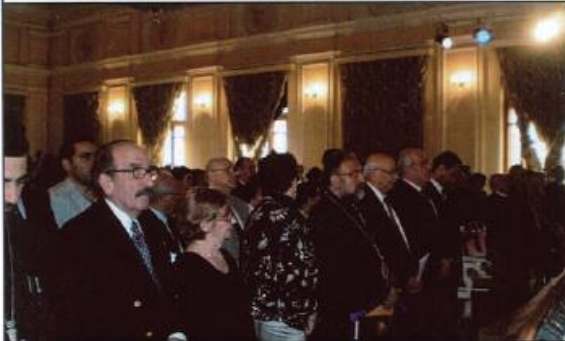
AGBU President participated in the 90th anniversary of the Howard Karagheusian Commemorative Foundation