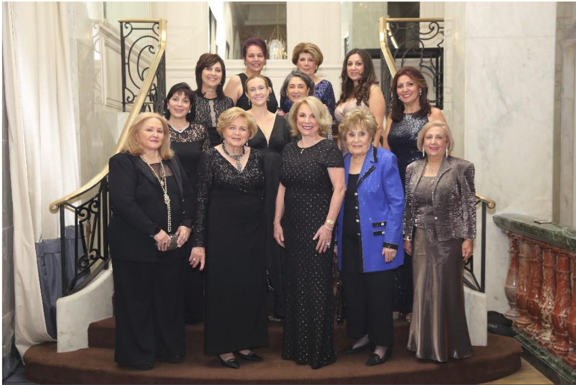
Gala Committee Members