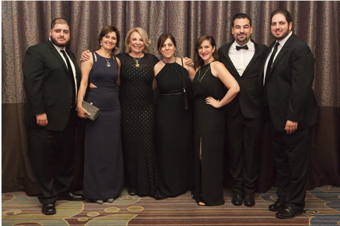
The AUA US Team